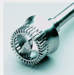
Dispermix D Homogeneous mixing Dispersing Emulsifying