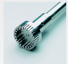
Batch dispersing X Dispersing Emulsifying

Hint: Pictures and text apply for shown execution only