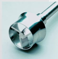
Jetstream mixer Y Homogeneous mixing